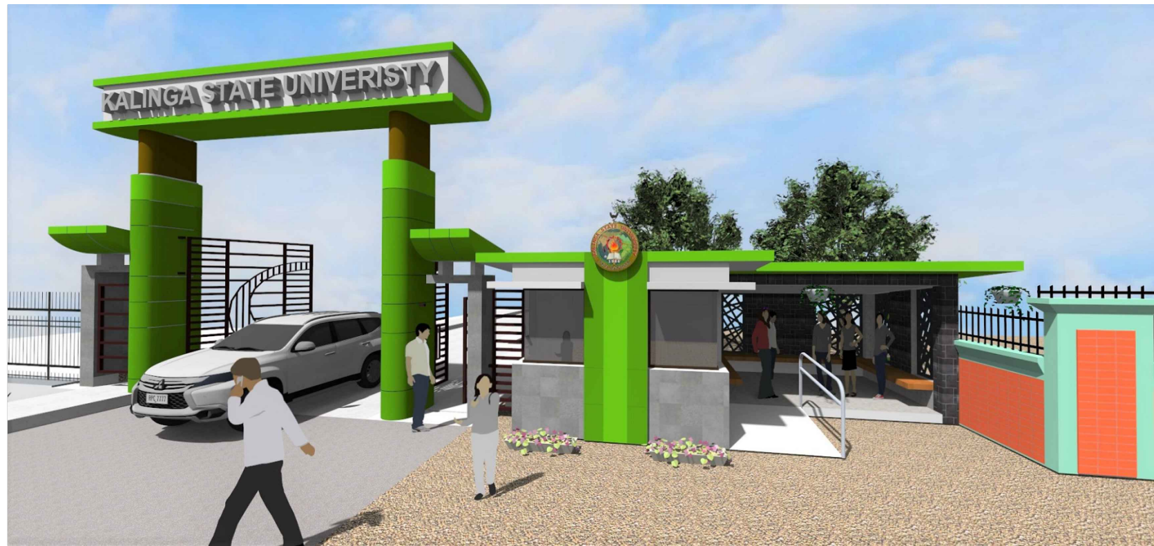
1 PERSPECTIVE A 2 SCALE NTS