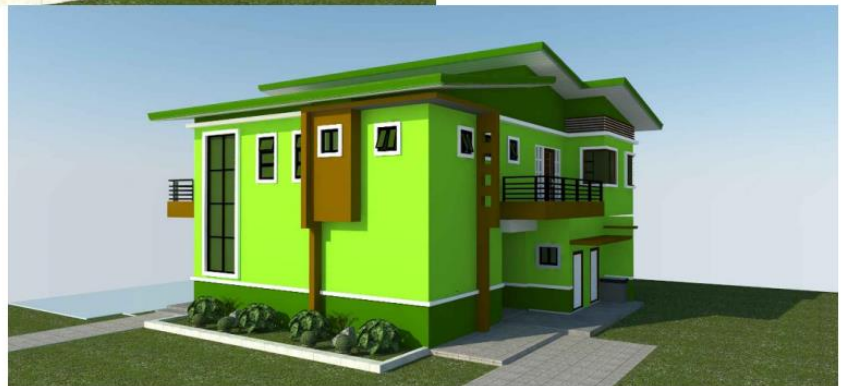
1 PERSPECTIVE VIEW SCALE: 1:100 0 500 1m 2m