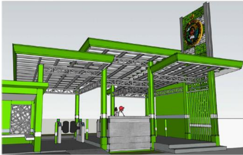
3D STRUCTURAL FRAME @ FRONT SCALE: NTS