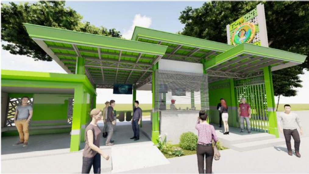
PERSPECTIVE VIEW SCALE: MTS

*The actual Drawing s, including site plans, are annexed in separate attachments/pages.