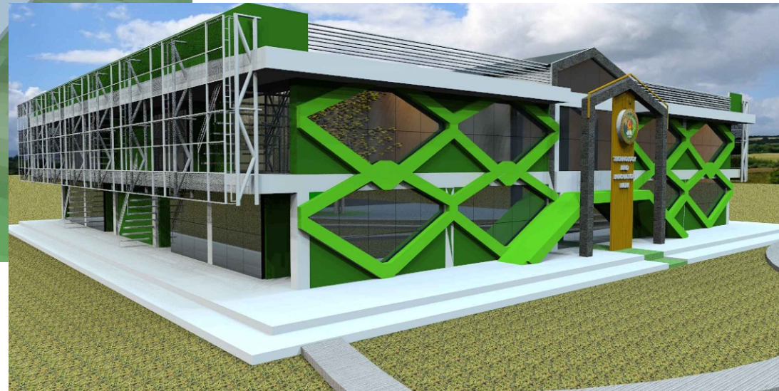
1 PERSPECTIVE VIEW SCALE: 1:100