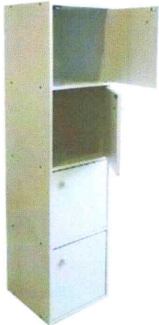
Sample of item no. 23 of Lot 1

For guidance and information of all concerned