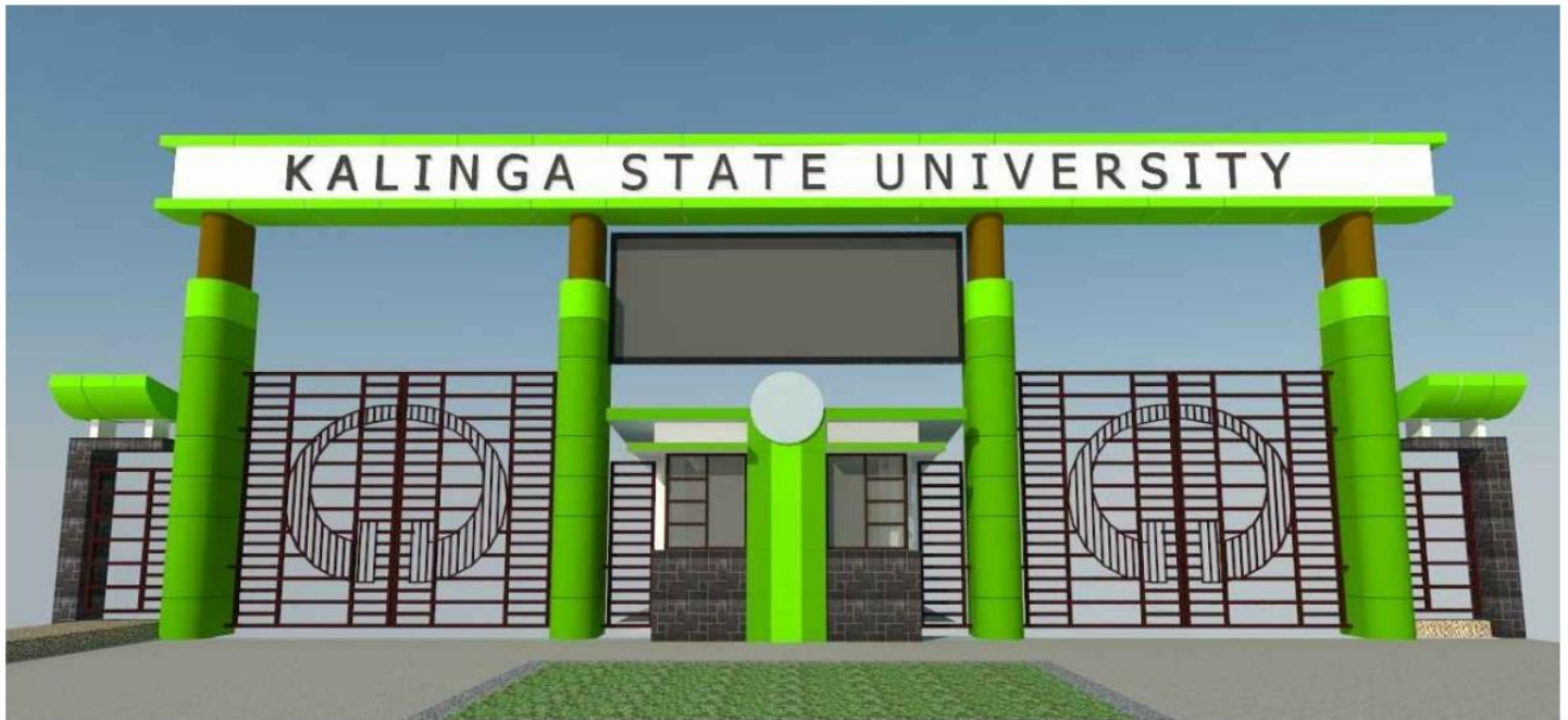
1 A 1 PERSPECTIVE VIEW