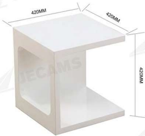
CCT-4007 custom center table MDF board Color: custom W42xD42x42 cm