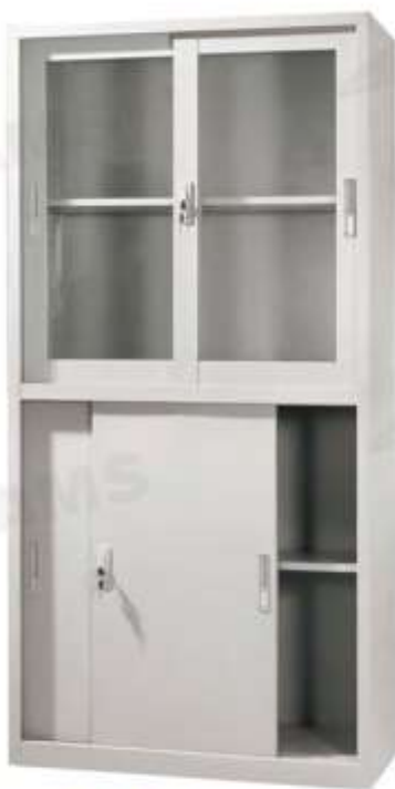
SDG-4 Sliding door cabinet light grey color