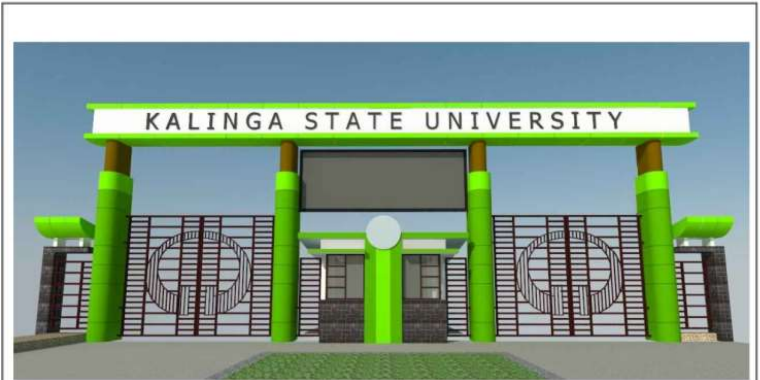
1 A 1 PERSPECTIVE VIEW